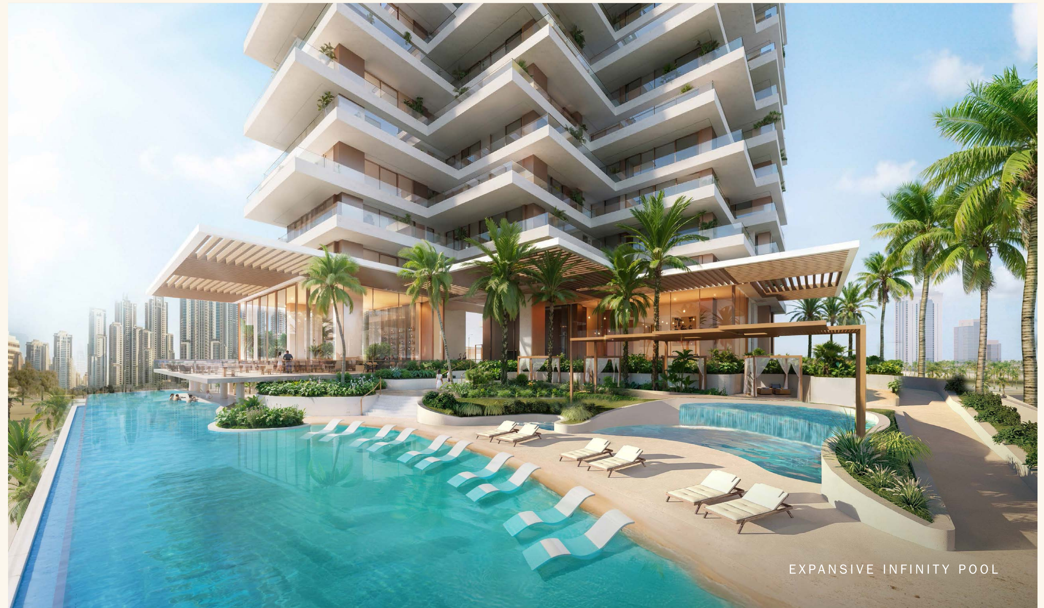
EXPANSIVE INFINITY POOL

Spanning the entire width of the building, this 60-meter podium-level infinity pool provides a perfect setting for families and friends to rejuvenate and enjoy.