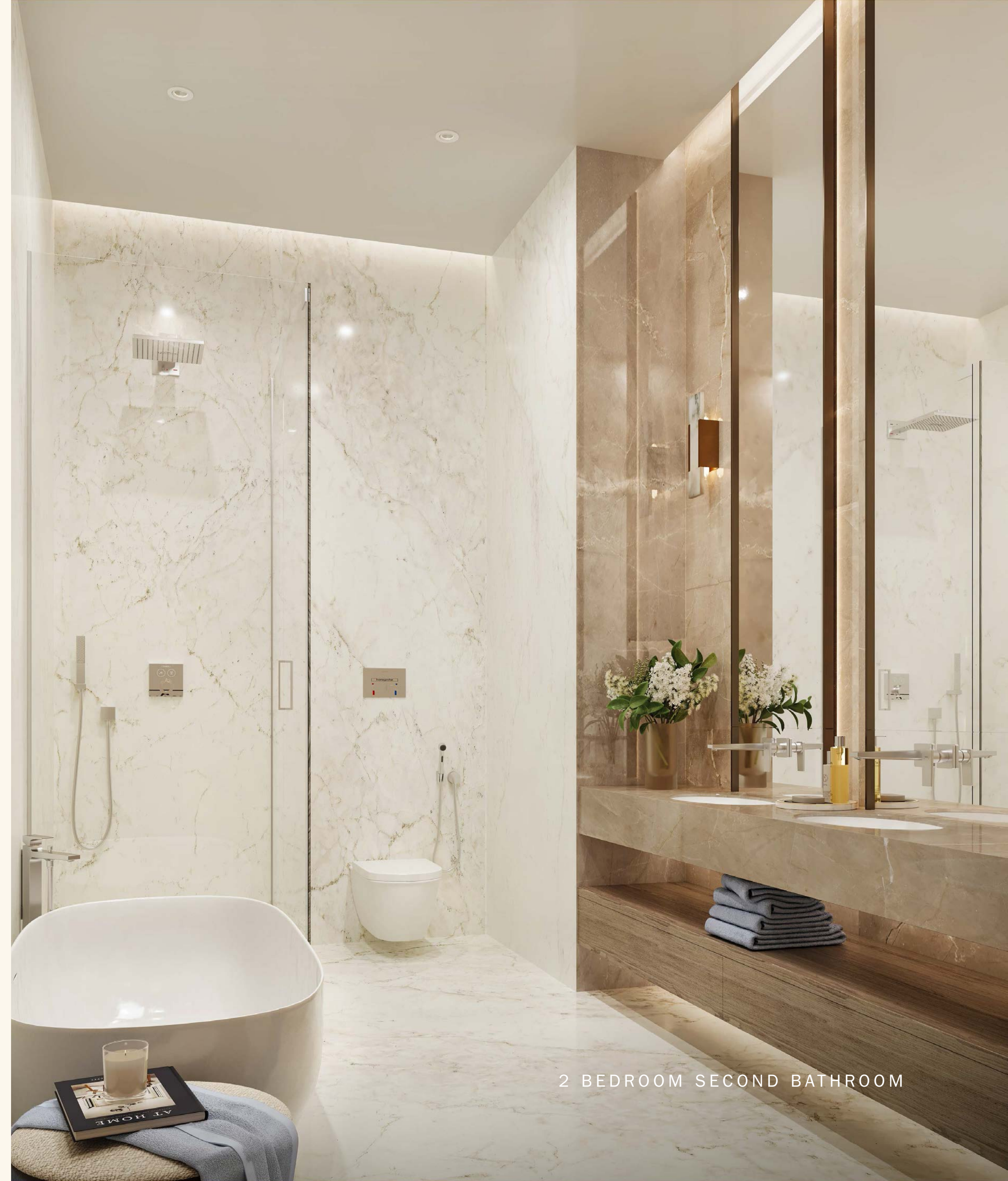
2 BEDROOM SECOND BATHROOM