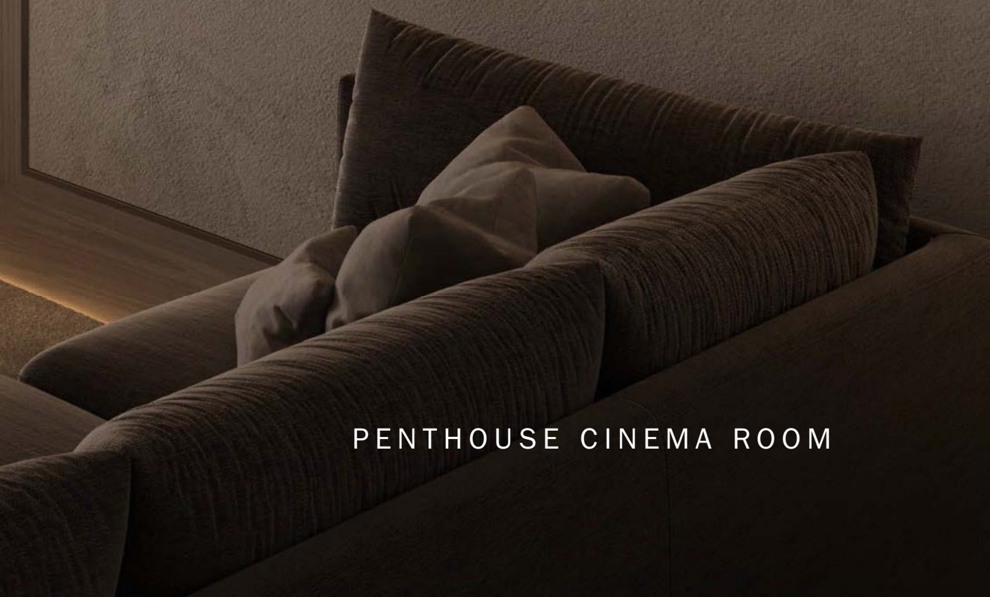
PENTHOUSE CINEMA ROOM