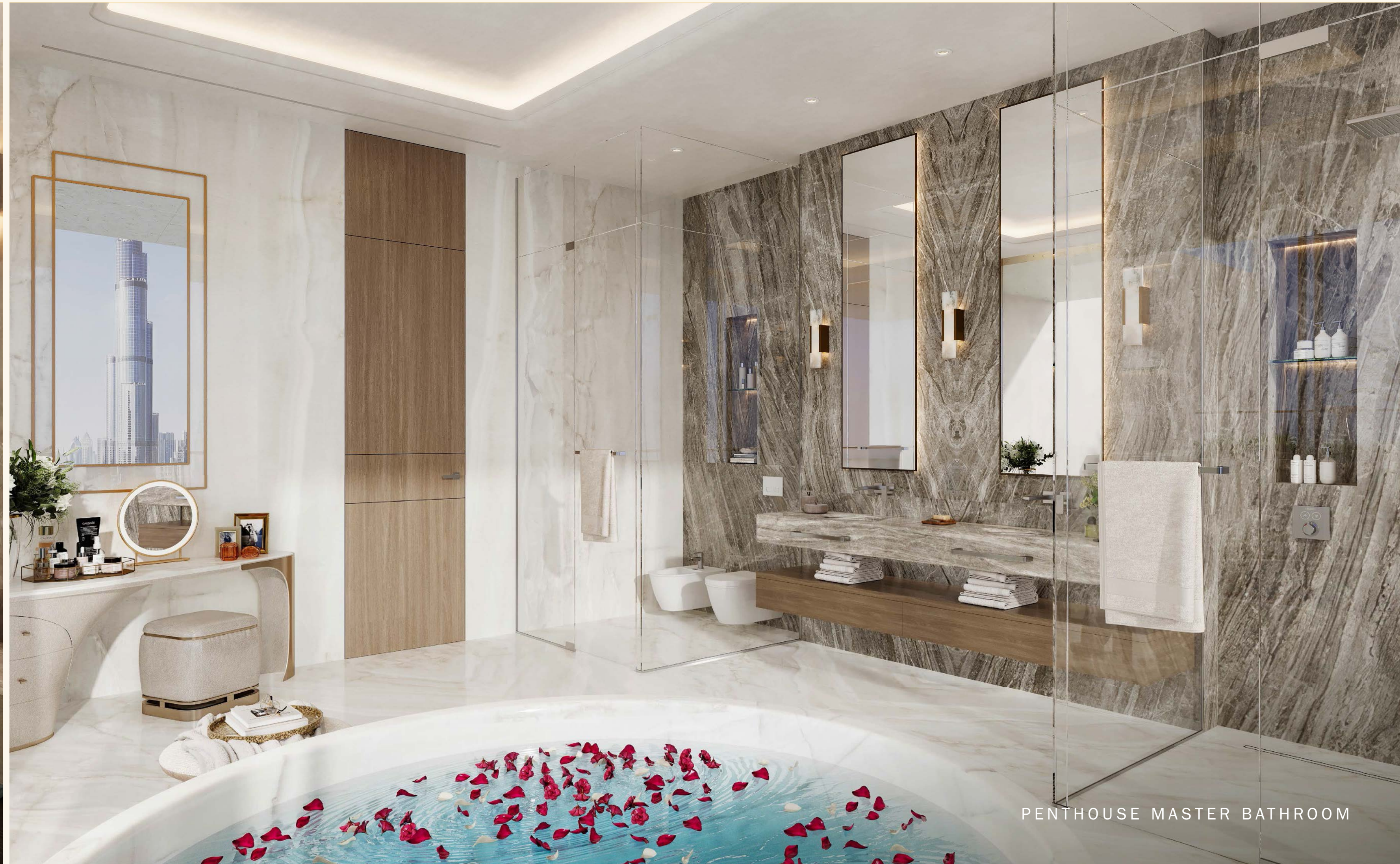
PENTHOUSE MASTER BATHROOM