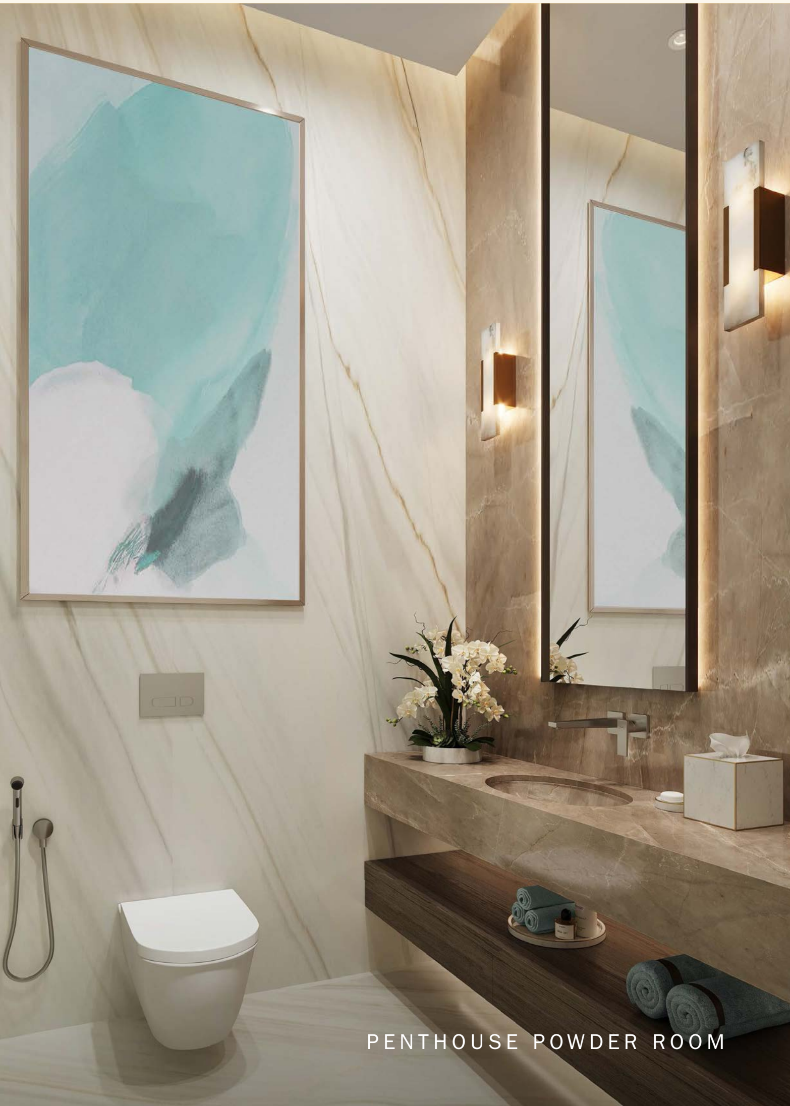
PENTHOUSE POWDER ROOM