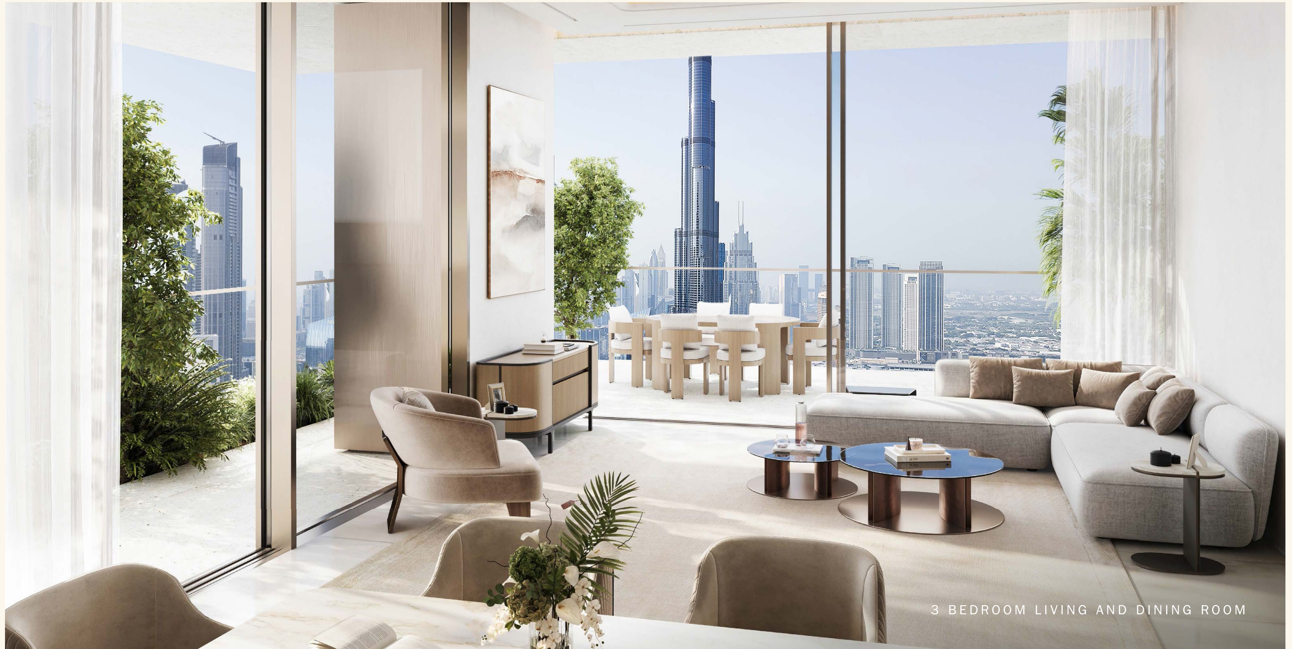
3 BEDROOM LIVING AND DINING ROOM