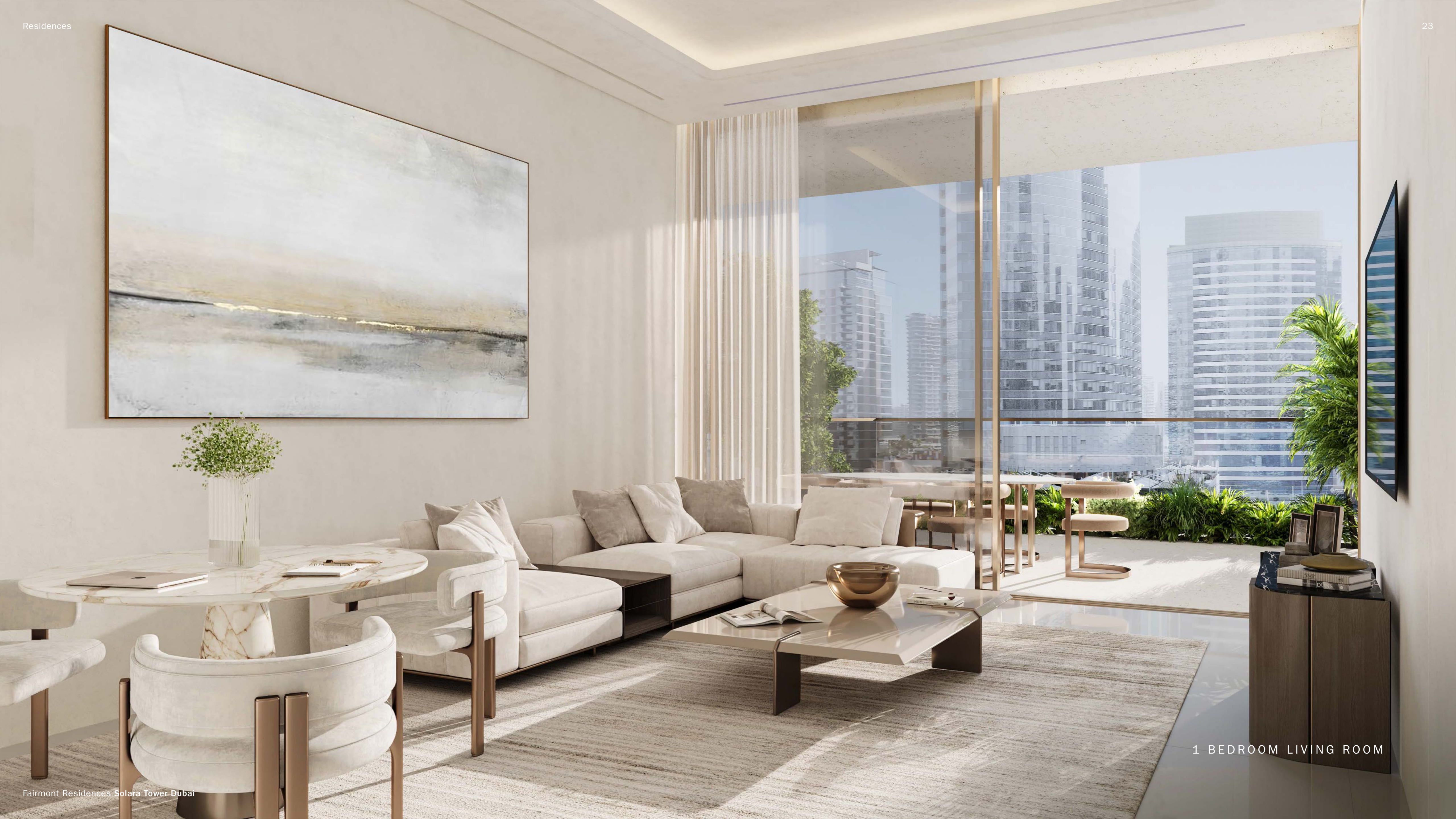
1 BEDROOM LIVING ROOM