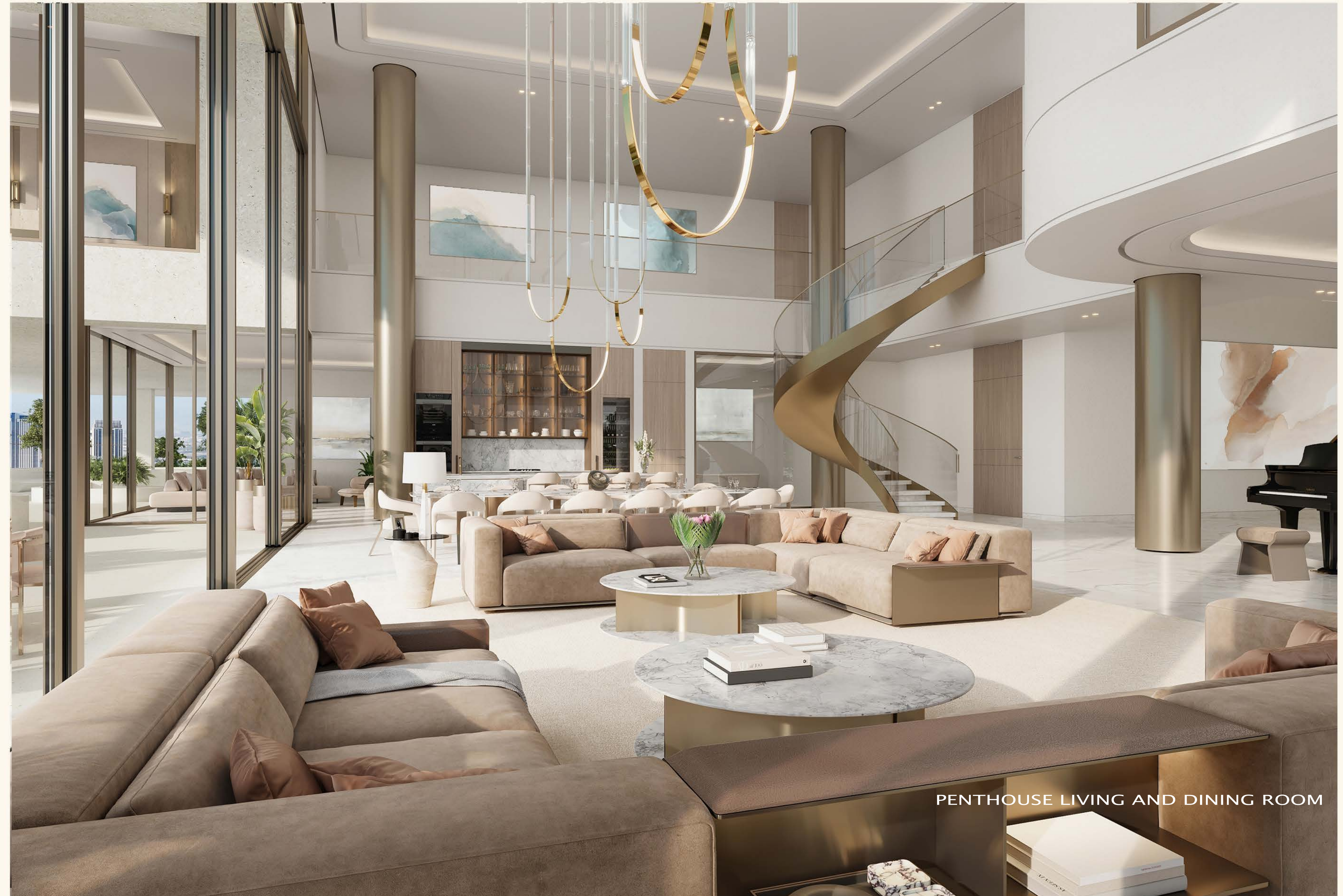
PENTHOUSE LIVING AND DINING ROOM