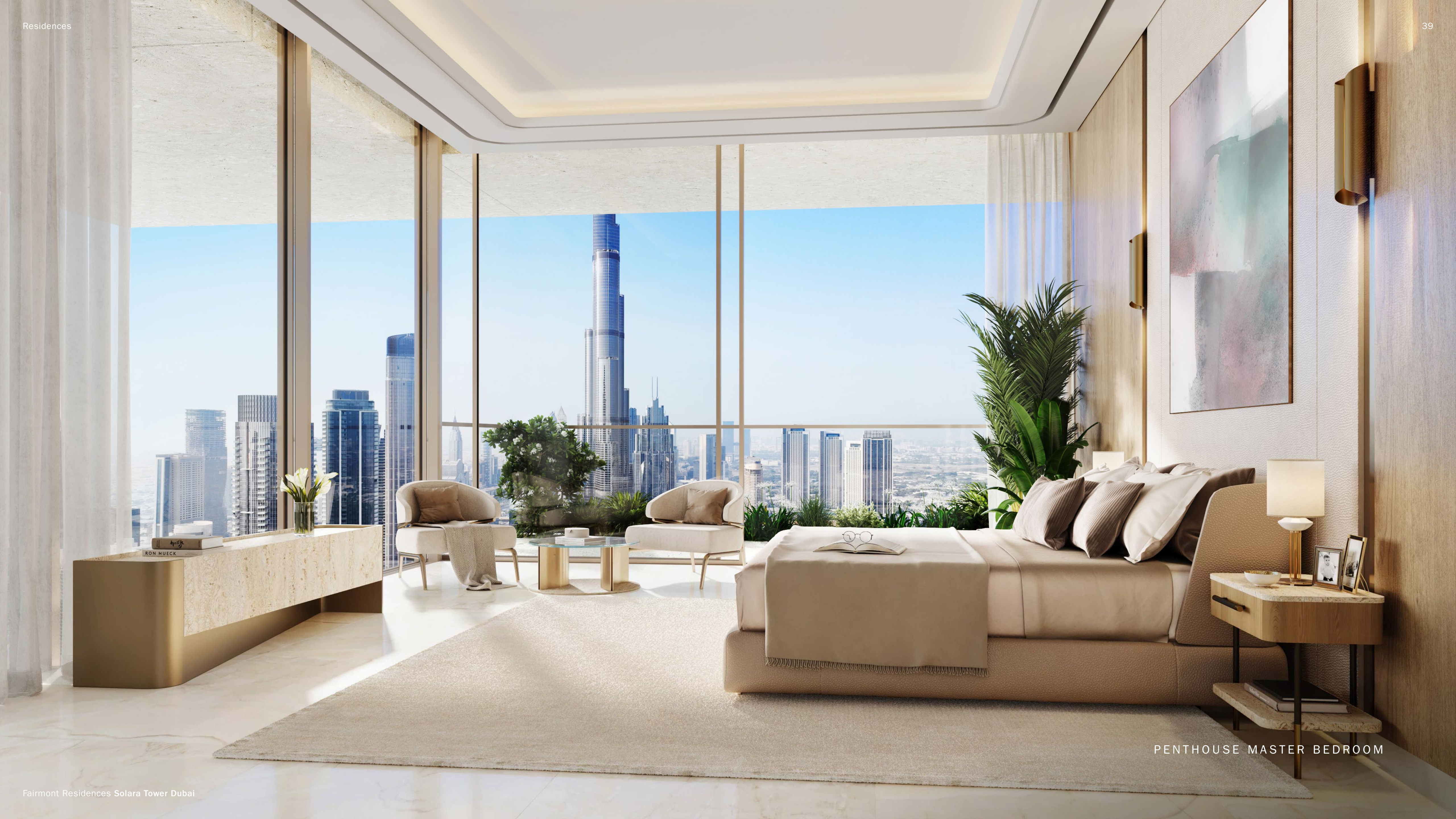
PENTHOUSE MASTER BEDROOM