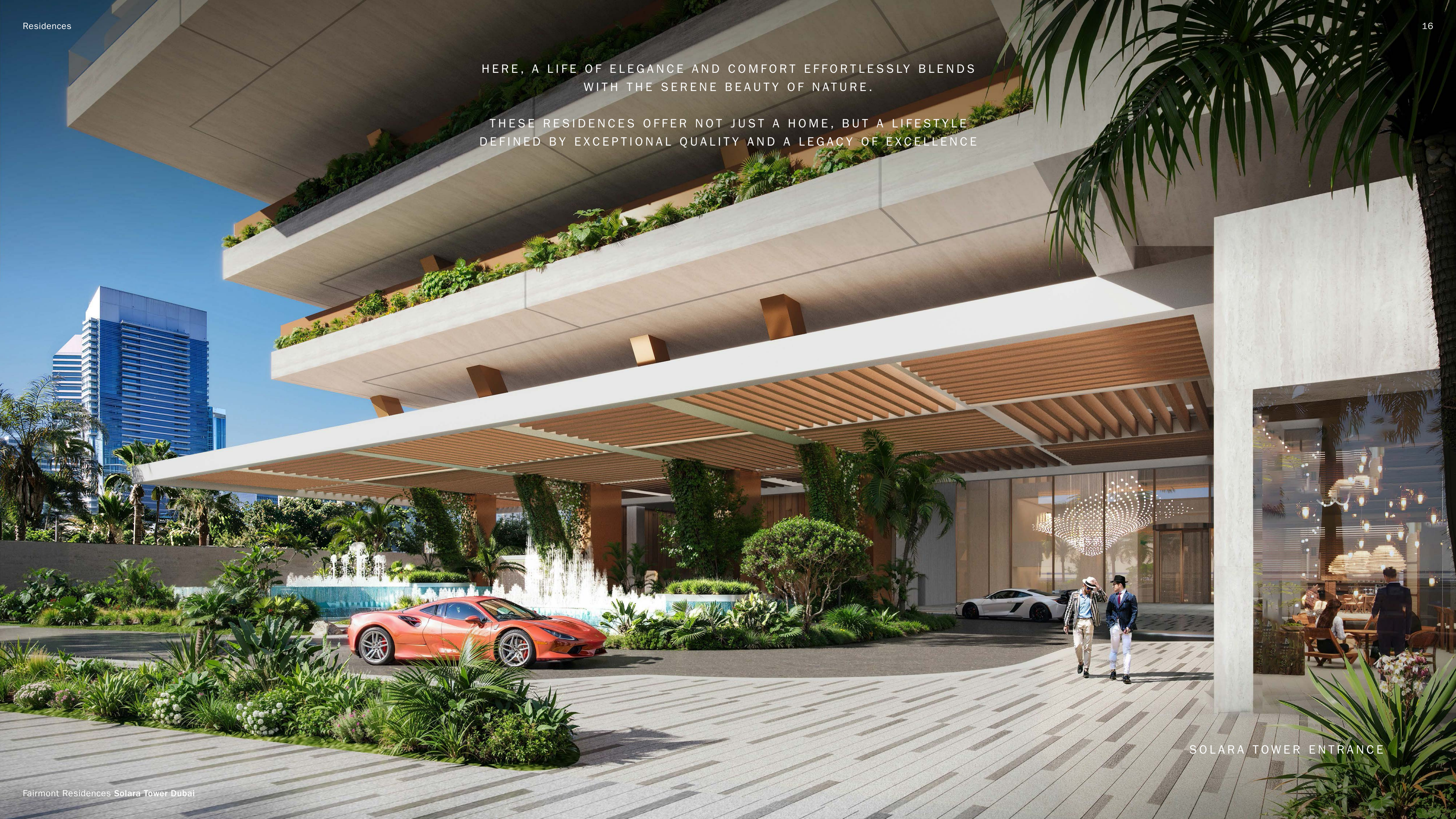
SOLARA TOWER ENTRANCE

THESE RESIDENCES OFFER NOT JUST A HOME, BUT A LIFESTYLE DEFINED BY EXCEPTIONAL QUALITY AND A LEGACY OF EXCELLENCE