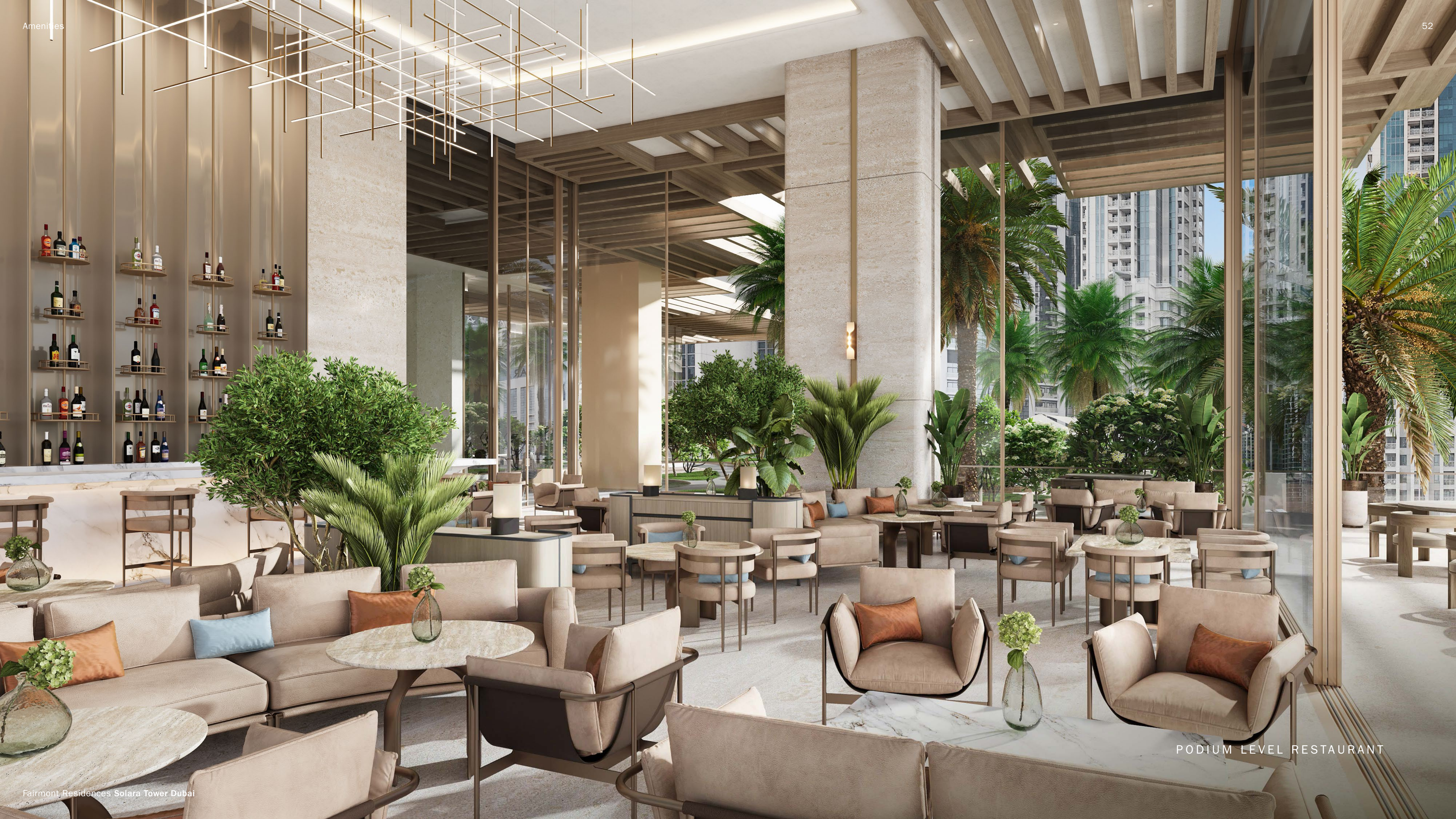
PODIUM LEVEL RESTAURANT