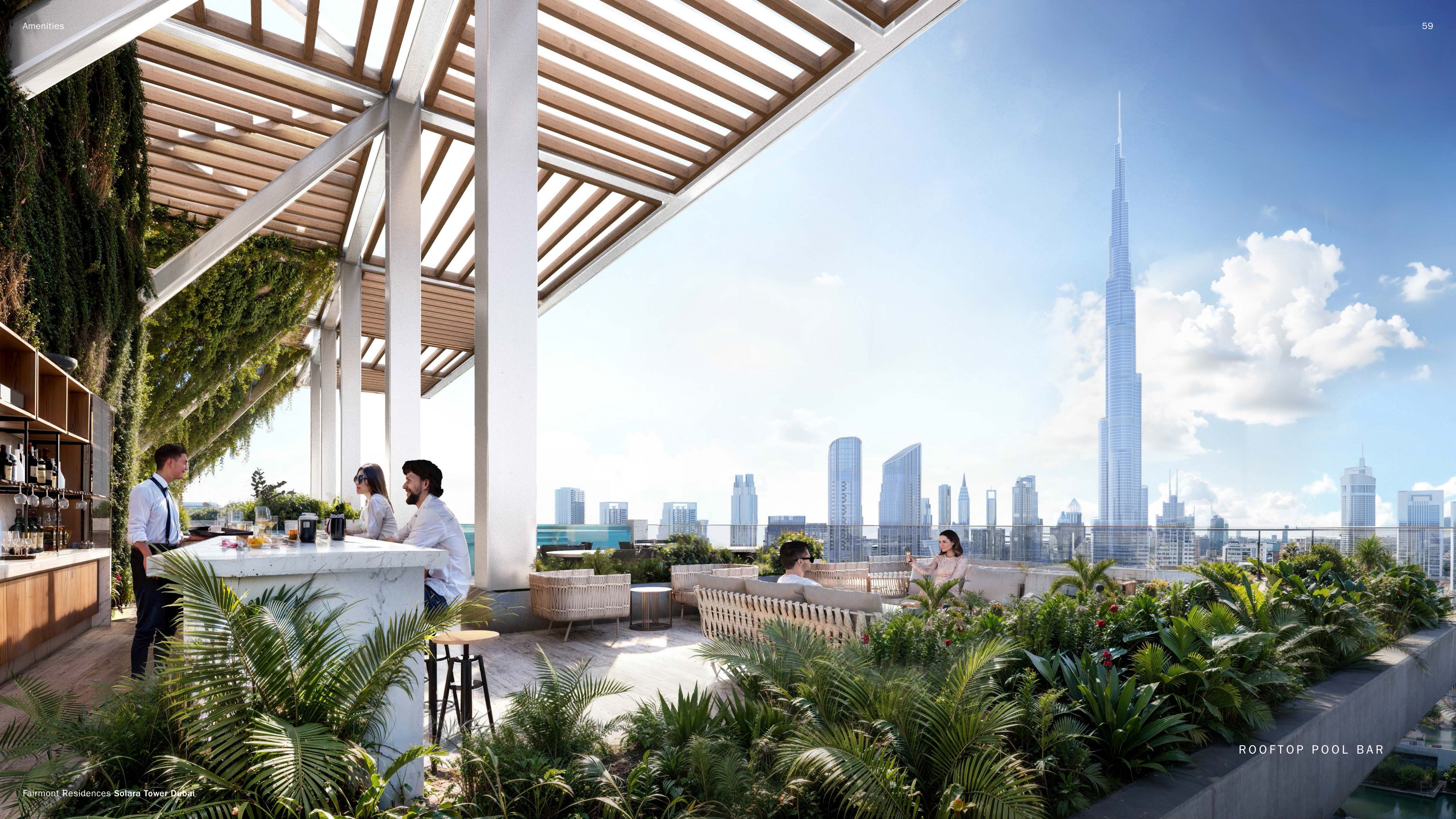
ROOFTOP POOL BAR