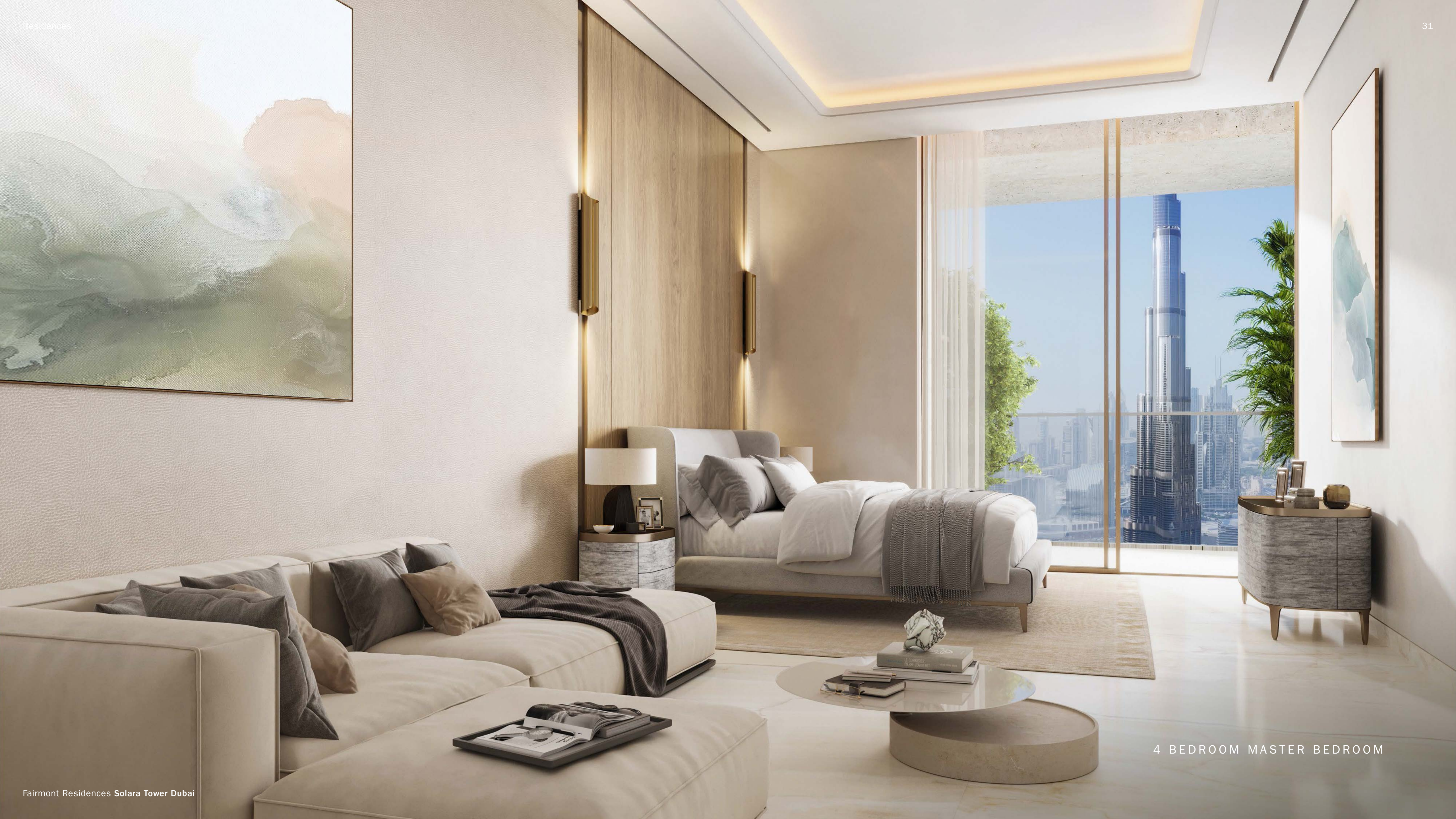
4 BEDROOM MASTER BEDROOM