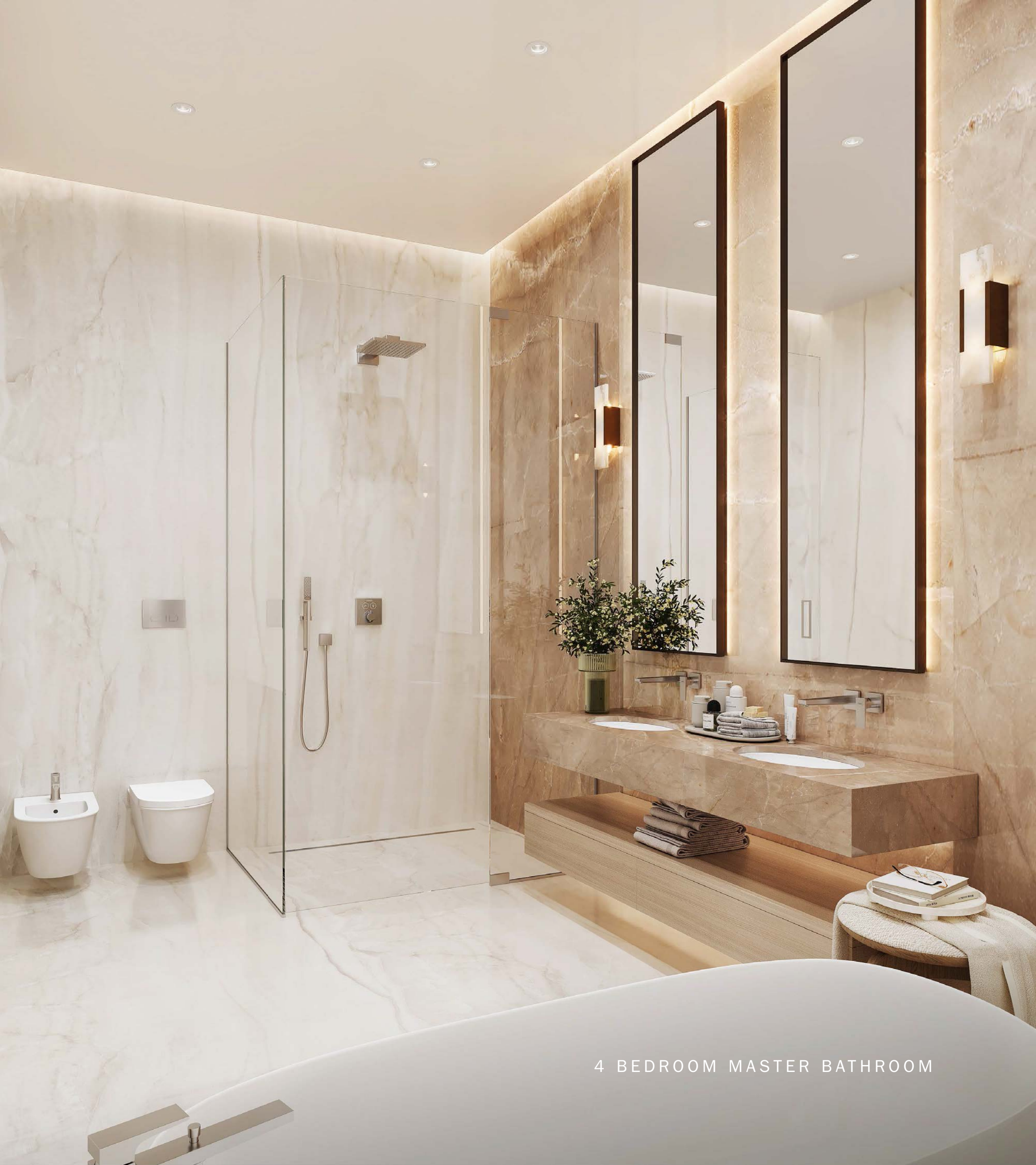
4 BEDROOM MASTER BATHROOM