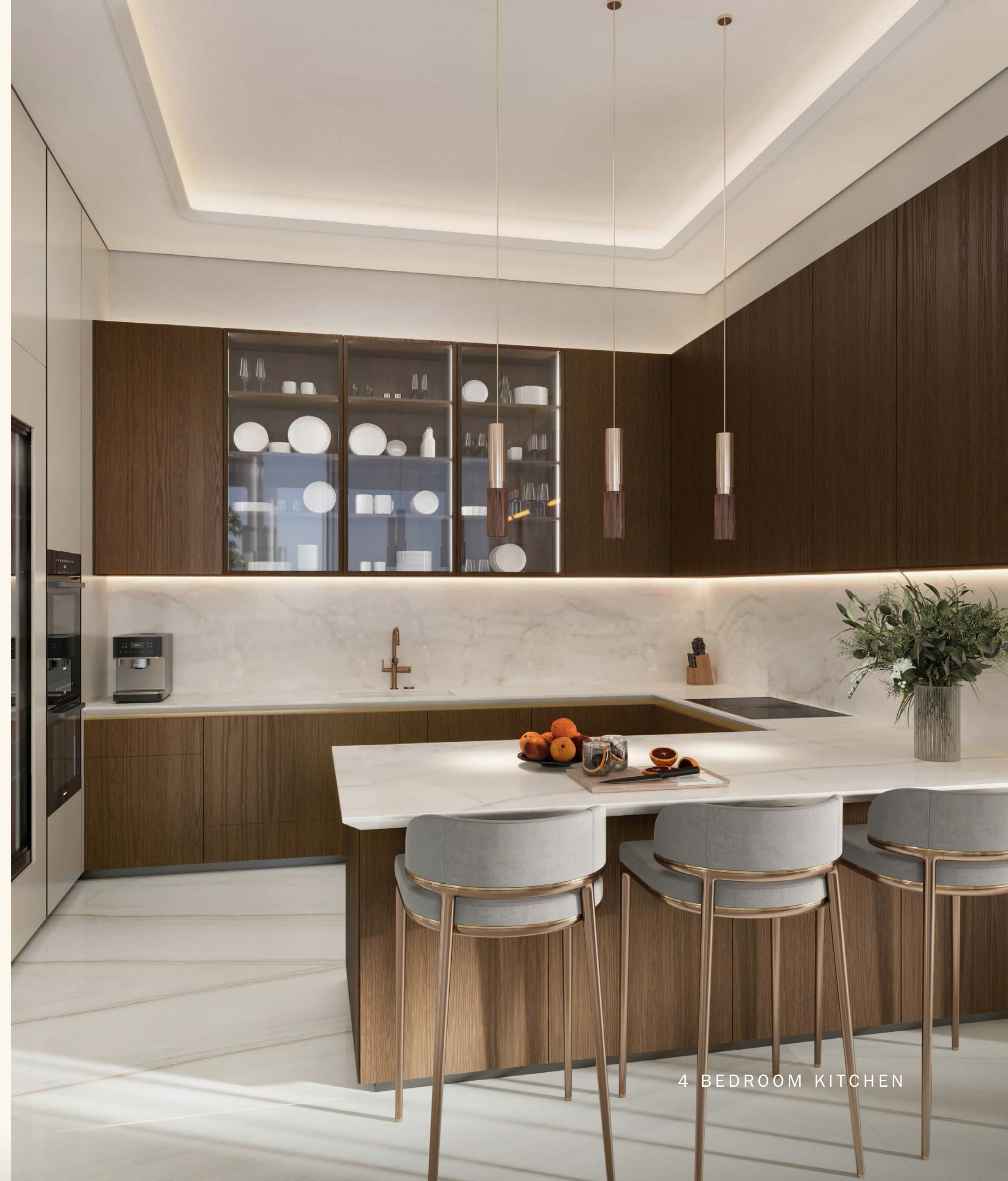
4 BEDROOM KITCHEN