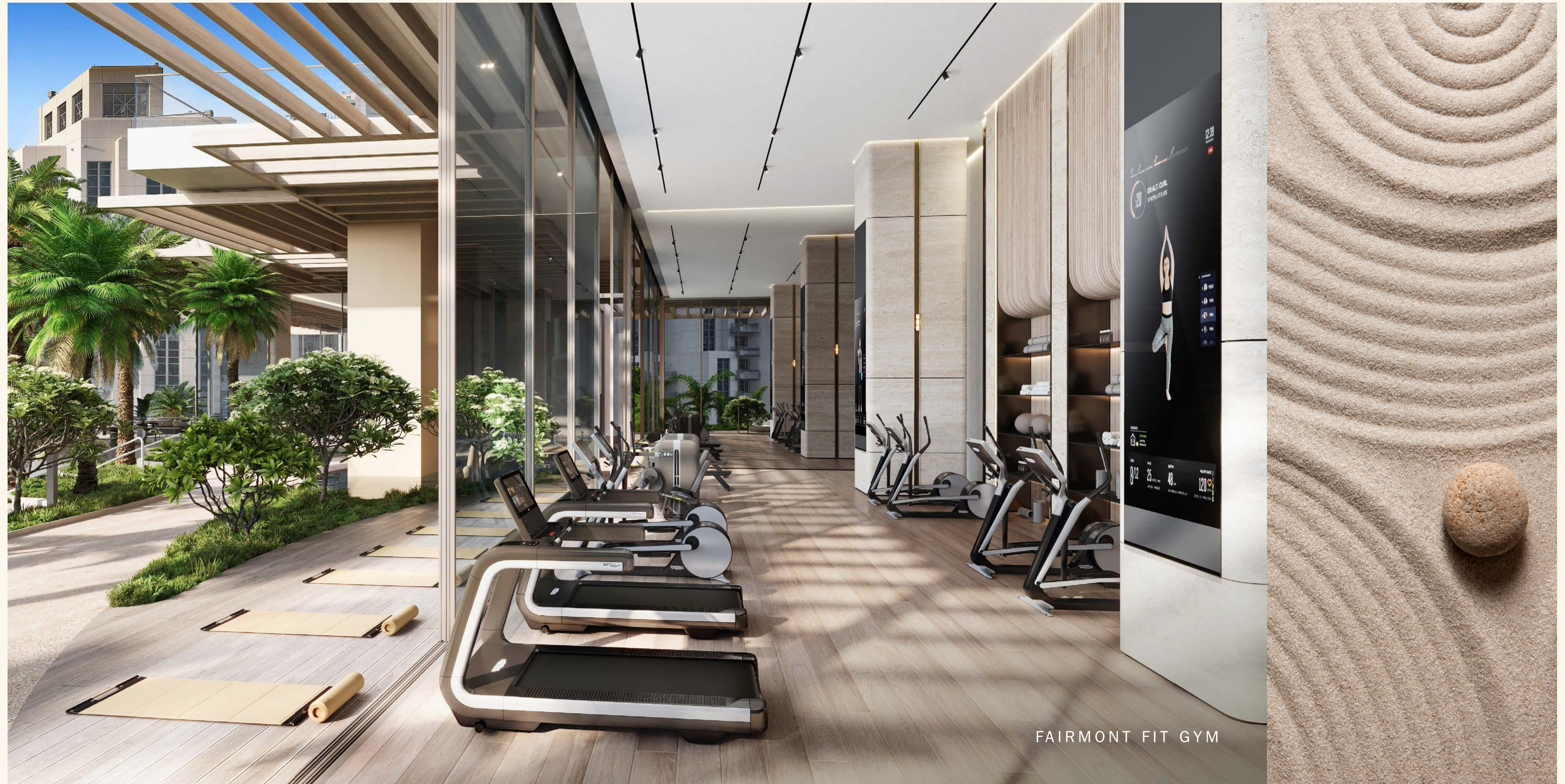
FAIRMONT FIT GYM