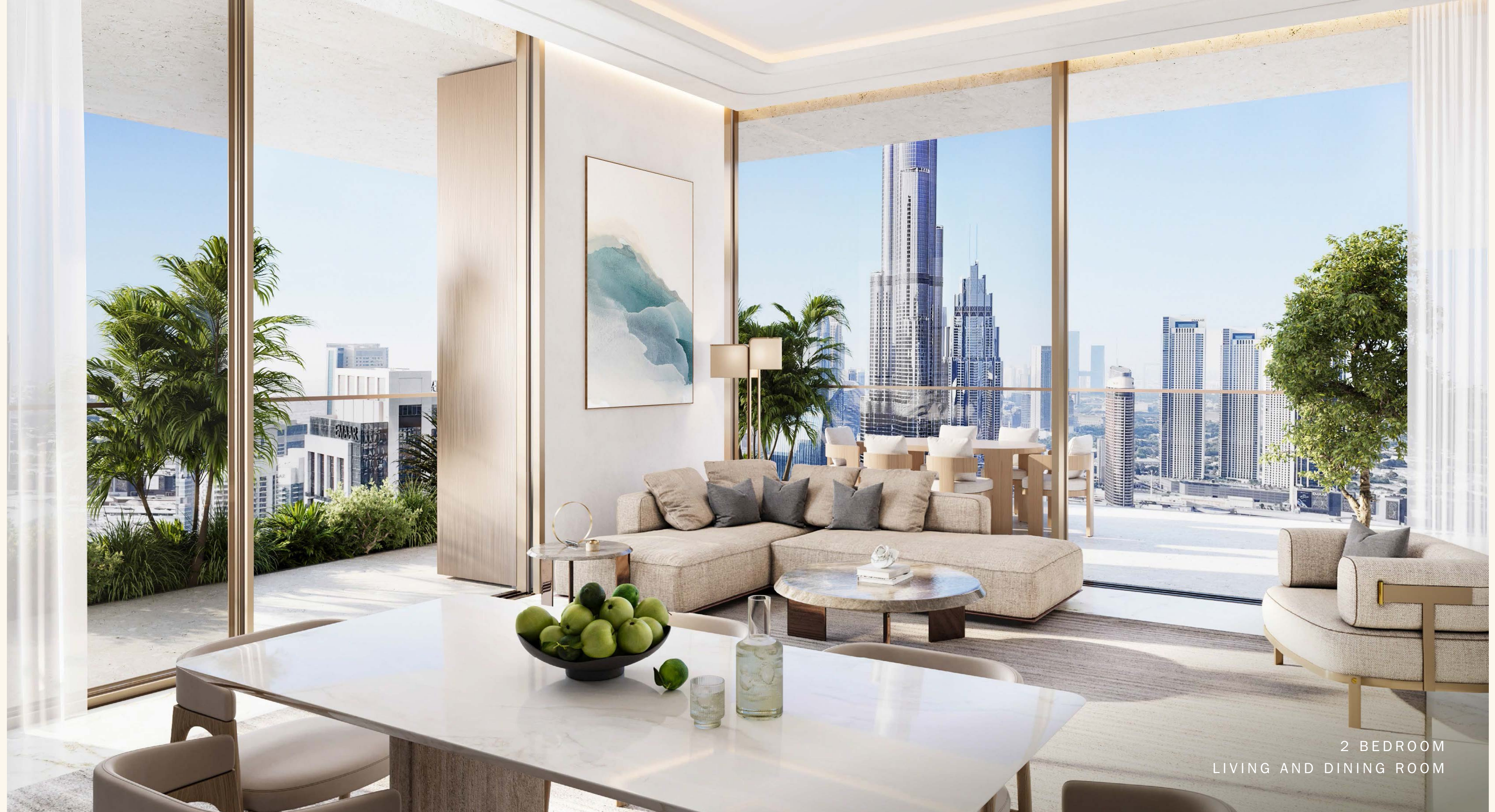
2 BEDROOM LIVING AND DINING ROOM

EXQUISITE SPACES FOR ENTERTAINING GUESTS, CONNECTING WITH LOVED ONES, OR SIMPLY DELIGHTING THE SENSES.