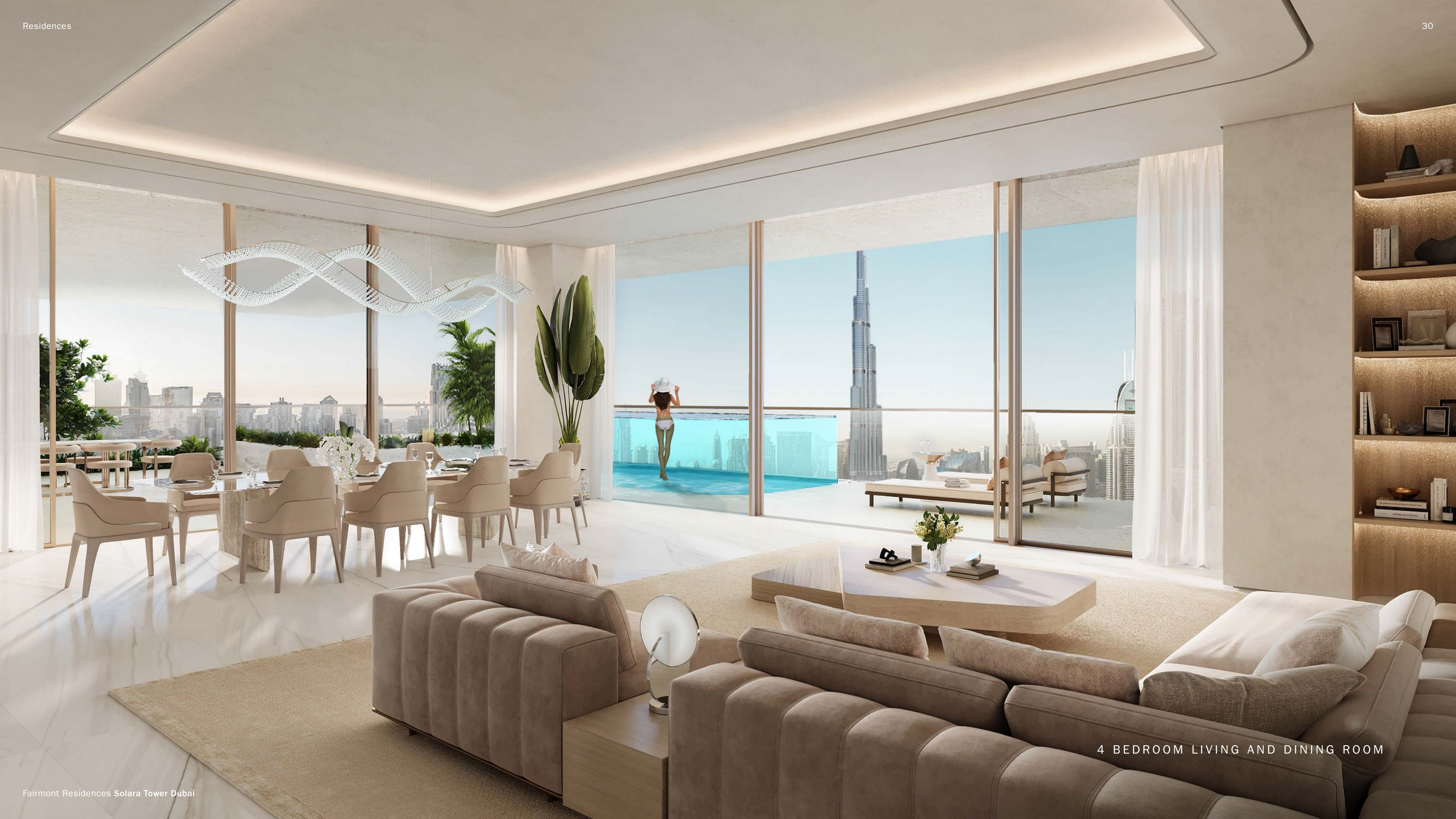
4 BEDROOM LIVING AND DINING ROOM