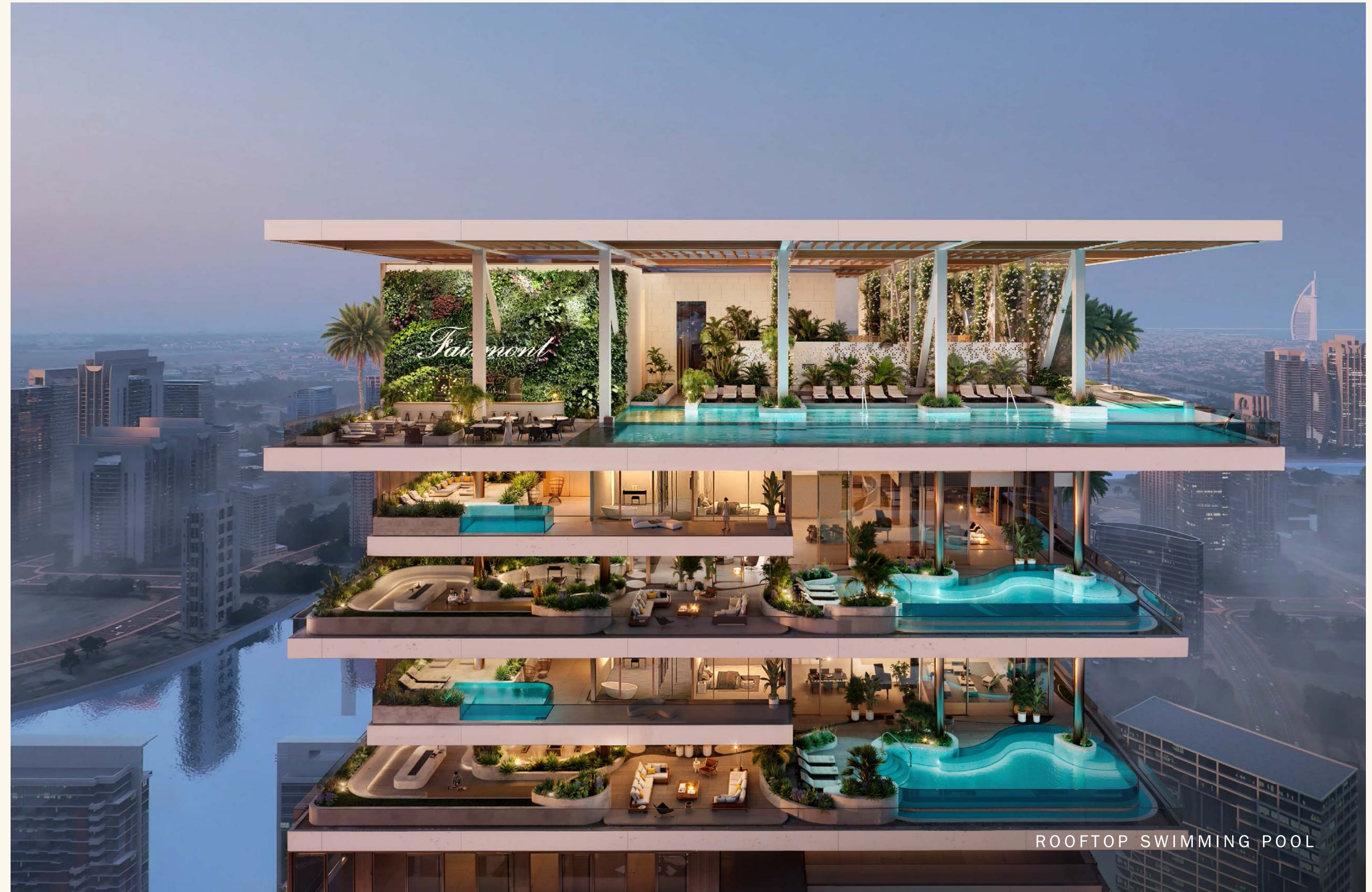
ROOFTOP SWIMMING POOL

Perched at a breathtaking 277 meters above street level, the rooftop offers a serene escape designed exclusively for adults. This stunning space is perfect for unquenchable socialites seeking alfresco dining as well as those looking for a tranquil retreat to relax and rejuvenate.