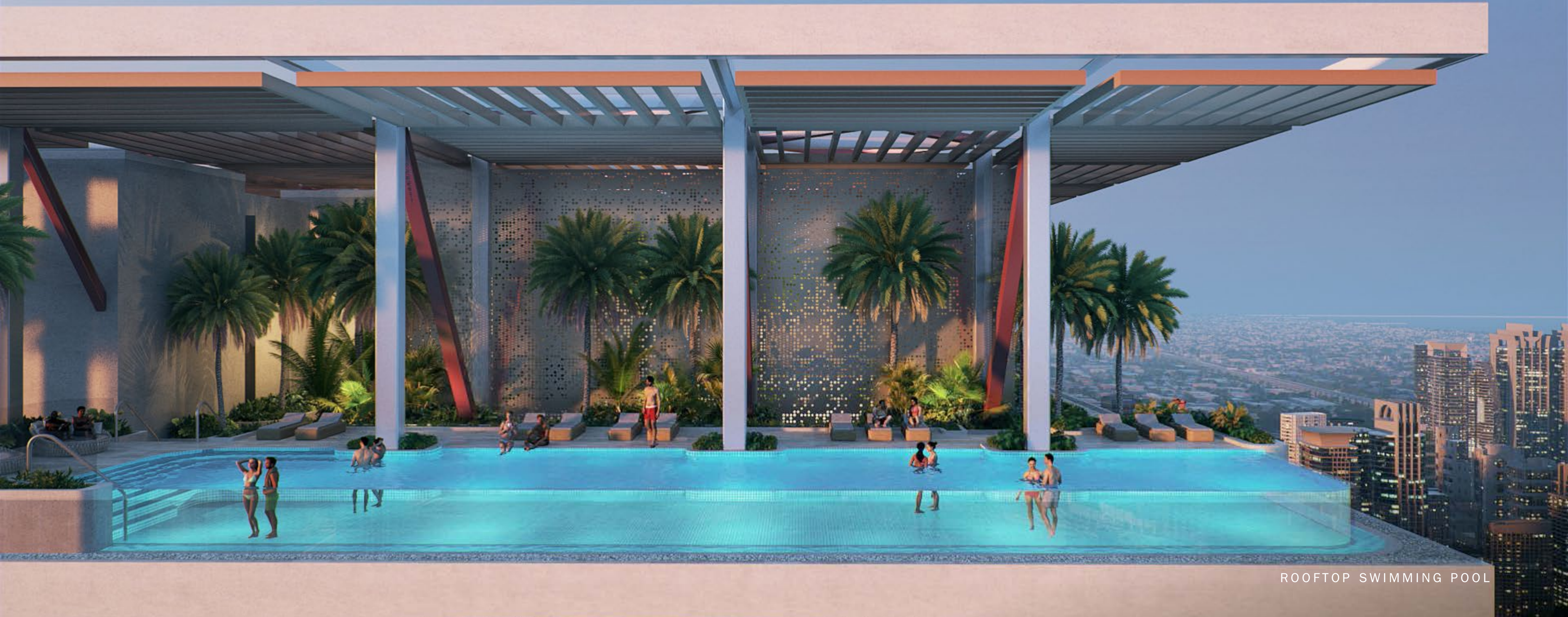
ROOFTOP SWIMMING POOL

WHETHER YOU'RE TOASTING WITH FRIENDS OR ENJOYING A QUIET EVENING UNDER THE STARS, THE ROOFTOP AMENITIES OFFER UNRIVALLED INDULGENCE AND A CELEBRATION OF LIFE AT ITS FULLEST.